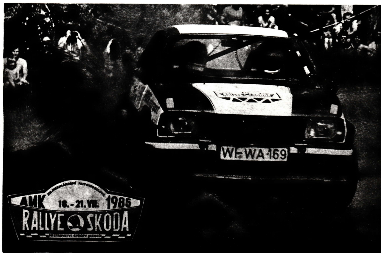
Ralf Richter - Burkhard Wendel 5 th. overall Opel Ascona 400