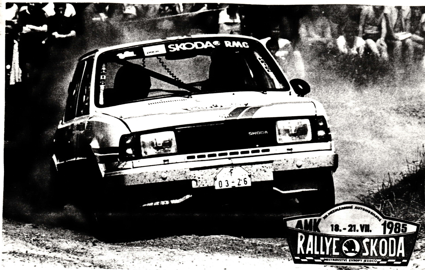
Ladislav Křeček - Bořivoj Motl 4 th. overall Škoda 130 LR